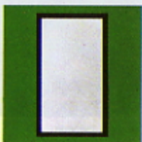
THE SECRET DOOR