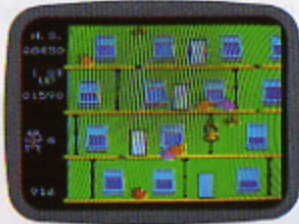
THE PIPE MANEUVER