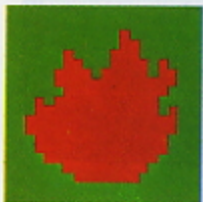
RED FIRE PARTICLE