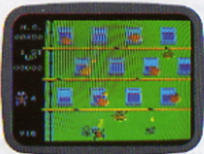
THE SECRET DOOR