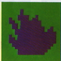
MAGENTA FIRE PARTICLE