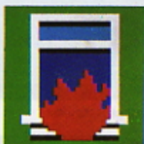
LARGE WINDOW FIRE