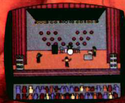
IT'S ONLY ROCK 'N' ROLL