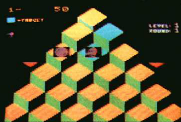
COMMODORE VIC 20