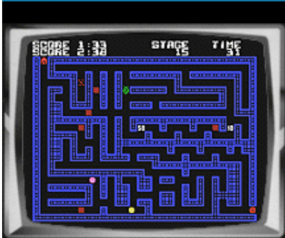
Maze Maniac