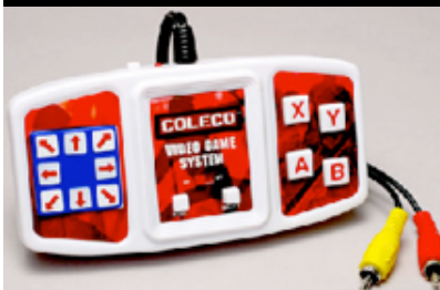
Coleco Video Game System