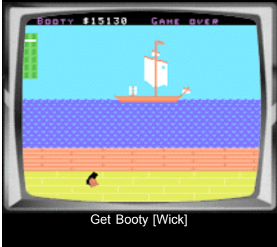
Get Booty [Wick]