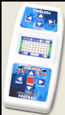
Coleco Electronic Football