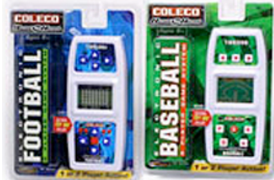
Coleco Electronic Handhelds

River West Brands is obviously using the name and history of Coleco to sell their new electronic products to the classic gaming audience. However, in the end they're giving us games that, while marketed to classic gamers, are made to appeal to our children. By themselves the games are average, but by associating them to a historic company they are negatively affecting the reputation of their products. River West Brands has alluded to also producing new ColecoVision-related products. Let's hope that if they do, they'll take the time to do their research and make a product that the ColecoNation will be proud of. [5]